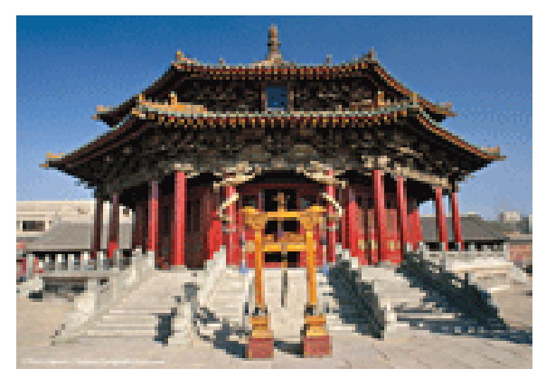
An exterior view of the throne room at the Imperial Palace in Shenyang, China. In front of the stairs is a jade chime with a goldenframe, made in 1761. Photo by Todd Gipstein, p. 323